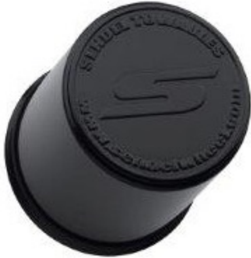
BLACK CAP / BLACK PLUG