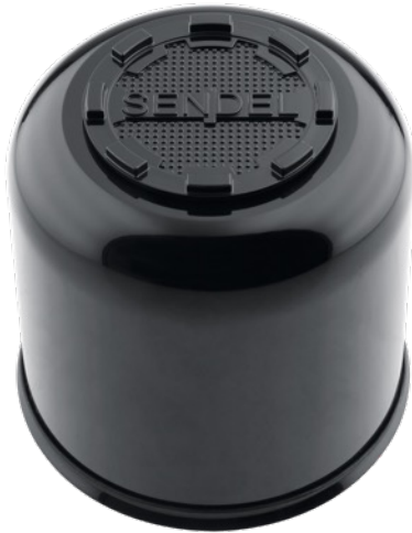
GLOSS BLACK CAP