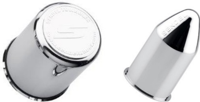
CHROME CAP / CHROME PLUG