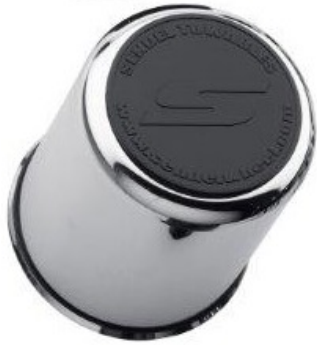
CHROME CAP / BLACK PLUG